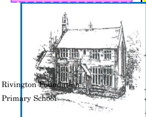
Rivington Foundation Primary School